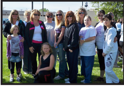
March of Dimes