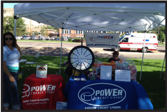
Orchard of Hope Walk